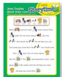
Storytime, Lesson 1, page 1