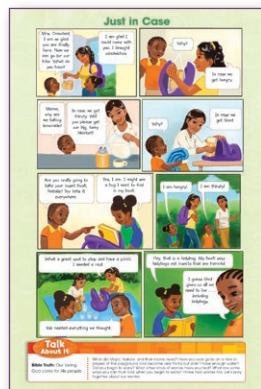
Storytime, Lesson 1, pages 2-3