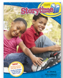
Storytime, Parent page

Say a personal goodbye to each student. Trust God to give you what you need.