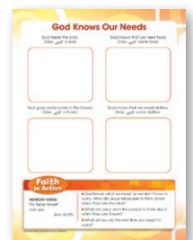
Storytime, Lesson 1, page 4

Distribute Storytime for Lesson 1 and have students complete the activity on page 4.